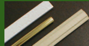
Flat, Pencil, Georgian